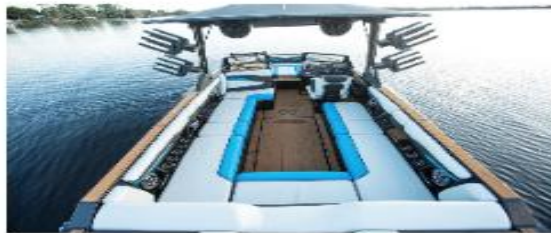
2022 Axis T250

Check this boat out: Malibu's new 25' wake surf boat . Seats up to 18 people.